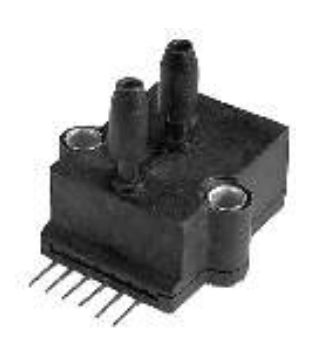
Representative photograph, actual product appearance may vary.

Due to regional agency approval requirements, some products may not be available in your area. Please contact your regional Honeywell office regarding your product of choice.