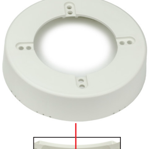
White Office Ivory