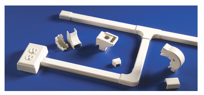
TSRP Power Rated Surface Raceway

TSRP surface raceway systems are designed to aesthetically organize and route either power or communications cables.