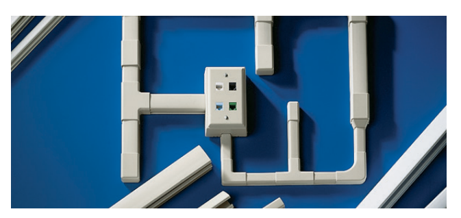
TSR Surface Raceway

Attractive and Affordable Power and Communication Cable Routing