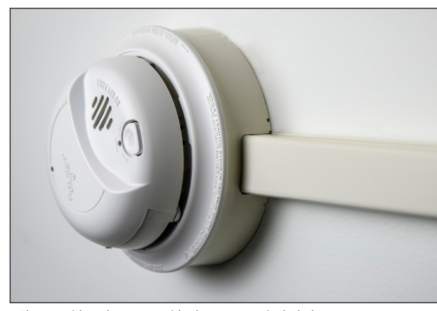
Shown with carbon monoxide detector, not included.